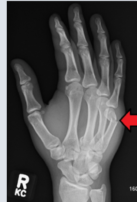
Fracture of the 5 th metacarpal neck